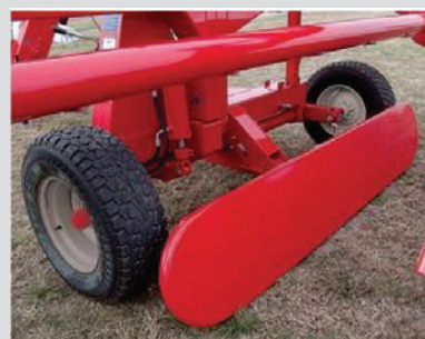
Grain Pusher System. Leaves very little grain at the end of the bag for easy cleanup.