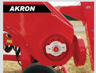
Roll transmission achieved through a sturdy reduction gearbox and only one chain.