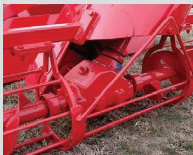
Bottom Angular Gearbox.

AKRON may change specifications and product designs in this or other brochure at any time, without previous notice. Pictures shown are for illustration purposes only.